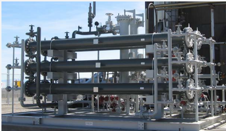
FuelSep® unit operating in Texas