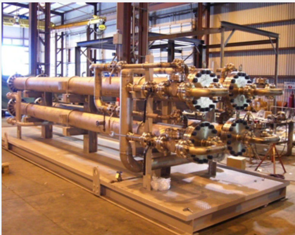
SourSep™ unit for installation on an Indonesian remote production field