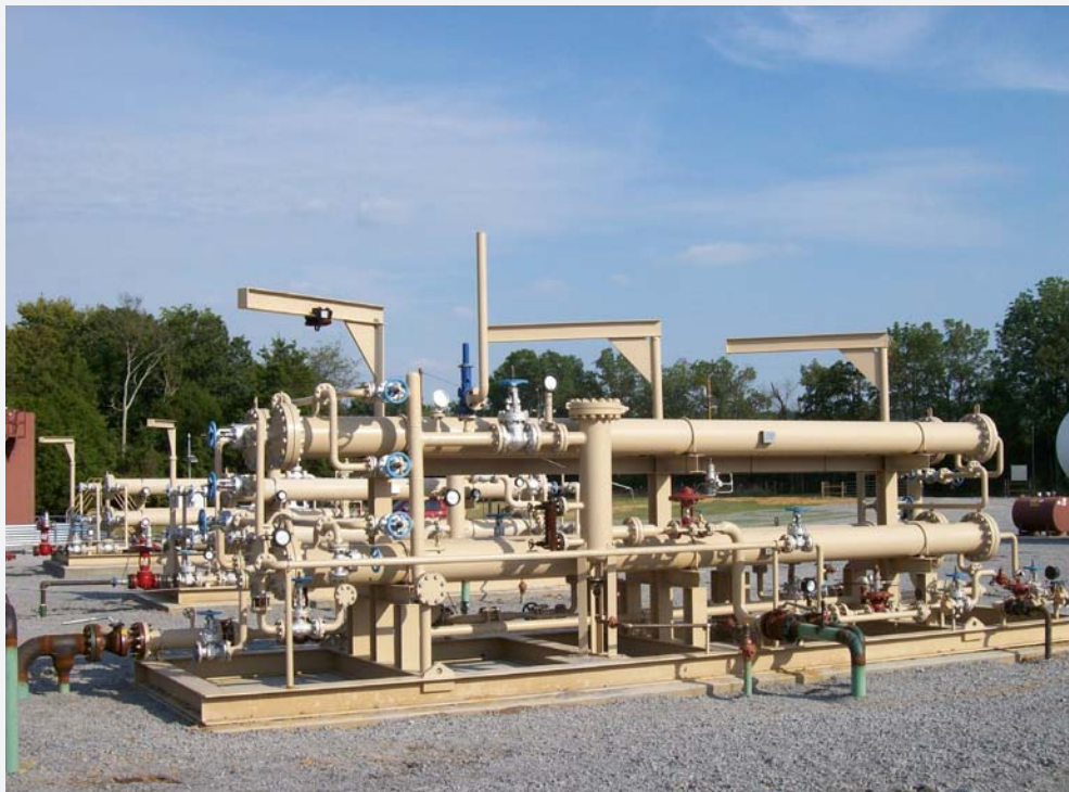
NitroSep™ units upgrading high nitrogen gas in California