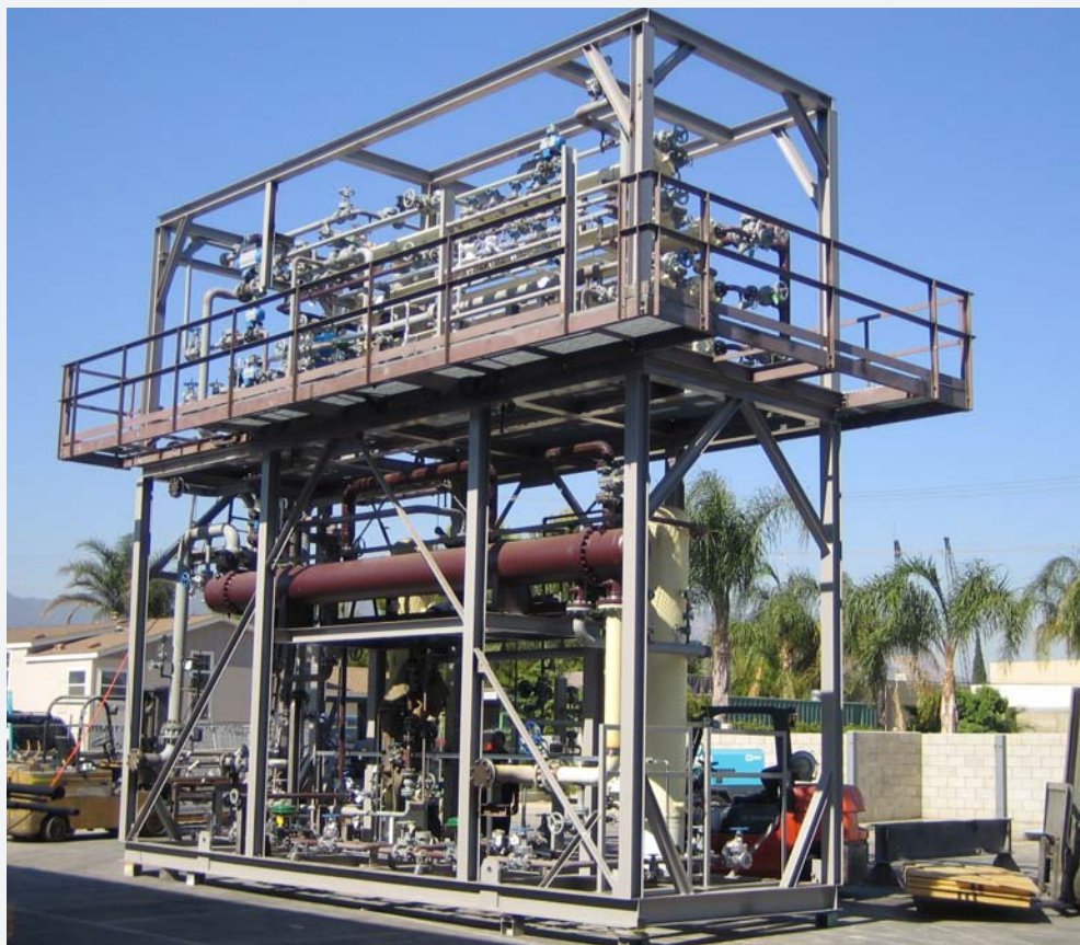
VoporSep® unit being checked prior to shipment