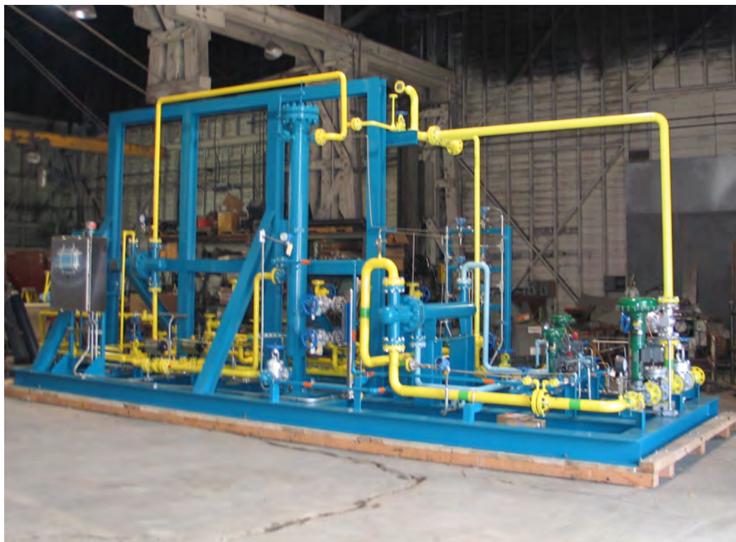
VaporSep-H 2 ™ system for hydrogen recovery from methanol plant purge gas