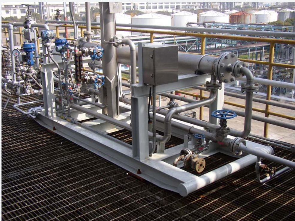
VaporSep® system for ethylene recovery