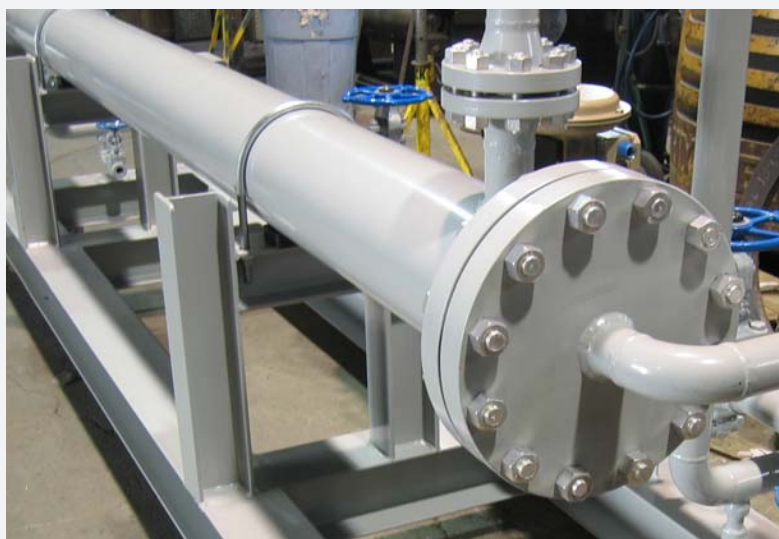
This VaporSep-H 2 ™ unit adjusts the syngas ratio in a GTL demonstration plant